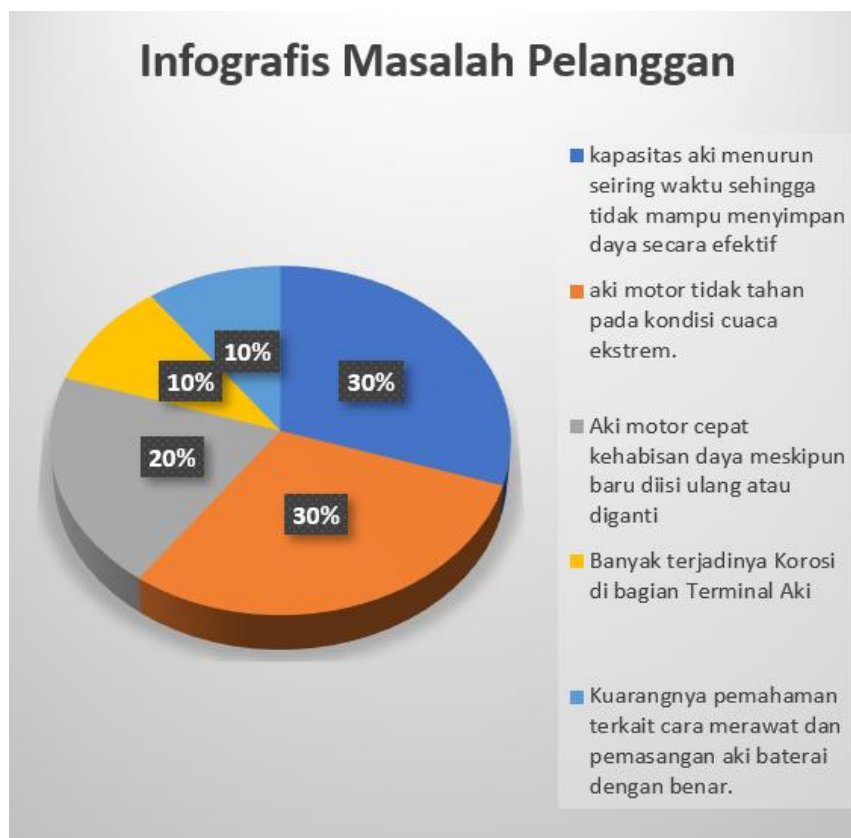
Figure 4. Customer Problem

Based on interviews with motorcycle battery users, several major problems were revealed. As many as 30% of respondents complained about the battery capacity decreasing over time, so power was not stored effectively. The problem of resistance to extreme weather was also expressed by 30% of respondents, which caused the battery performance to decrease drastically or be damaged in extreme temperature conditions. In addition, 20% of users stated that the battery ran out of power quickly even though it had just been recharged or replaced, adding to the inconvenience and additional costs. Corrosion on the battery terminals was experienced by 10% of respondents, which disrupted the electrical connection and charging efficiency. Finally, 10% of respondents felt that the lack of understanding about proper battery maintenance and installation was also a significant problem. These results indicate the need to improve battery quality and provide maintenance education to users. The customer problem infographic is shown in Figure 4.