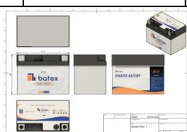
Figure 6. Quality Measurement BATEX Battery