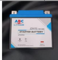
Figure 7. Quality Measurement ABC Battery

A comparison of these two lithium battery motorcycle battery products shows that BATEX batteries excel in safety, temperature resistance, longer service life, and more competitive prices. In contrast, competitor products offer lighter weight and longer warranties, although their service life is shorter and their prices are higher. This comparison gives consumers an idea of each product's value and advantages in meeting their needs and budgets.