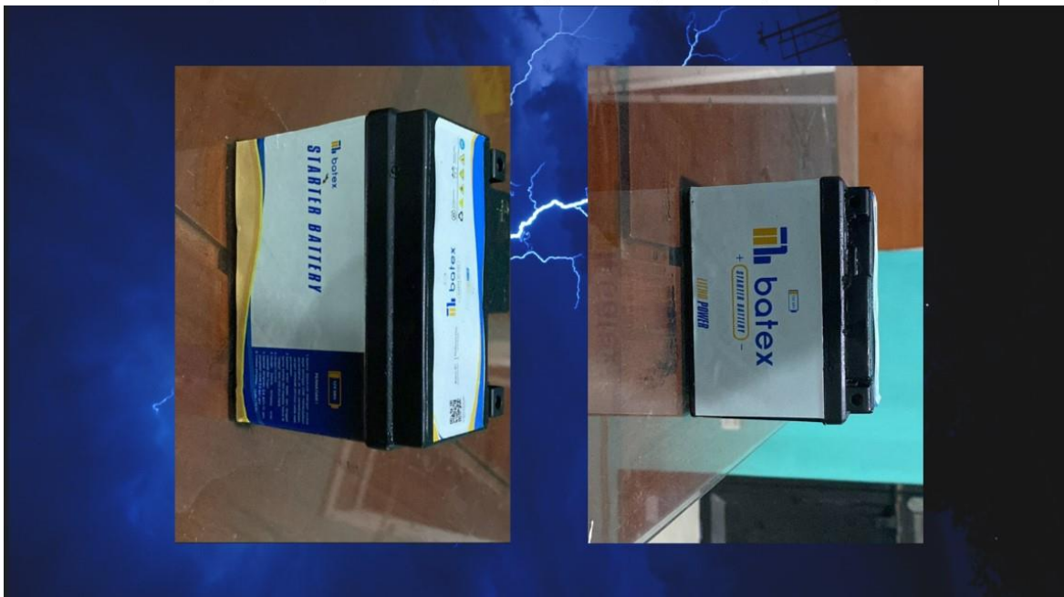
Figure 3. Prototype Design Lithium Battery