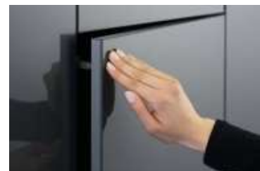
Figure 15: Scalloped handle with different additional materials on one of the Etch House furniture. Figure 16: Cabinet with tip-on-swing application.