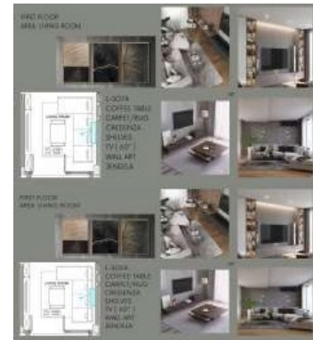
Figure 4: Kilmer's "analyze" design stages.

With the conclusion from the analysis reached, the next Kilmer design stage that can be carried out is the synthesis stage. At this stage, the designer will implement the design results of their decisions in real terms.