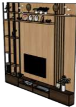
Figure 5: Kilmer's "ideate" design stage.

With the conclusion from the analysis reached, the next Kilmer design stage that can be carried out is the synthesis stage. At this stage, the designer will implement the design results of their decisions in real terms.