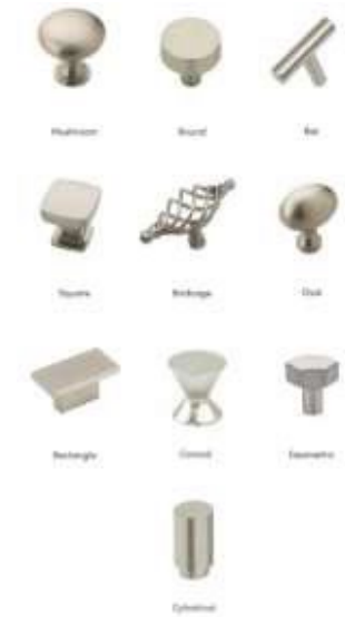
Figure 7: Types of pull handles. (Source: Wayfair. 2019) Figure 8: Types of knob handles. (Source: Wayfair. 2019)