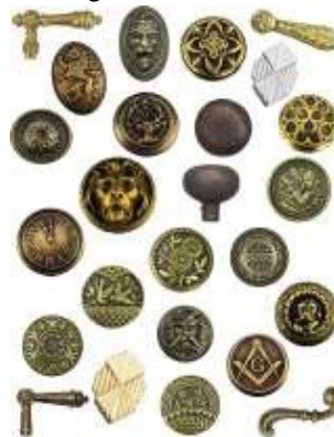
Figure 9: Novelty handles.