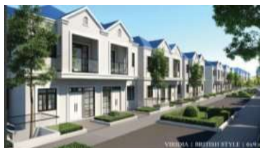
Figure 1. Simple facade of residences at Lavon Swan City, Tangerang

In this study, a combination of modernism and minimalism is used in the design of the Lavon Swan City multi-storey house which has a modern-classic exterior. In realizing these two things, choosing the right furniture is one of the important elements that a designer needs to pay attention to. Furniture itself has a variety of functions of each, the storage function being one of them. Through this residence would affect the furniture handle selection.