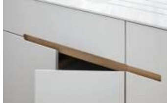
Figure 12: Rebated handles with contrasting materials are applied in the gap of kitchen cabinets at Lambeth Marsh's house in London.