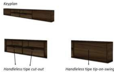
Figure 17: Application of handleless cut-out and tip-on- swing on storage furniture.

Thus resulting in tip-on-swing and cut-out handle design as the final result that can be applied to the design of modern minimalist home storage furniture at Lavon Swan City. In addition, the use of handleless tip-on-swing and cut-out model as the final choice also supports the functionality side as stated in Tunjung Atmadi's opinion which is the modern minimalist concept prioritizes