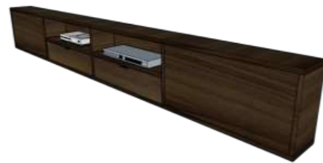
Figure 6: Kilmer's "choose" design stage, selected tip-on-swing and cut-out handle models.