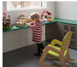
Figure 14: Scalloped handle with the same overall material used on the Red Zephyr Blue House.