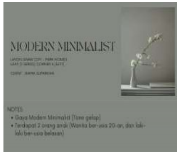
Figure 3: Kilmer's "collect" design stages.