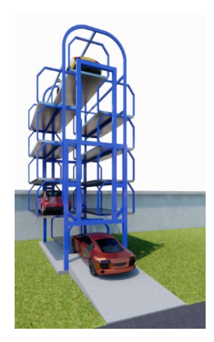
FIGURE 18. Illustration of a vehicle exiting the parking tower

8) The car would stop at the bottom area of the parking tower, and after the rotor stops turning then, the vehicle can be removed from the parking tower (Figure 18)