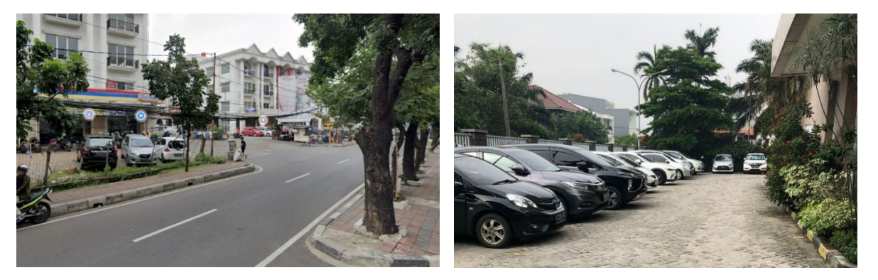
FIGURE 8. Meruya Ilir Highway

The parking lobby can accommodate 40% of the total apartment parking, but because it can only accommodate 40%, residents must hunt in parking their vehicles because the parking ratio is not by the number of units and not by government regulations. In addition, if visitors filled the parking area, it would reduce the parking slots for the residents who live in the apartment. This is also one of the factors why most residents end up parking their vehicles in the parking area of shophouses in front of the apartment area another reason; why residents park their vehicles in the shophouse area is because of the accessibility that is easier to reach to access the main road (Figure 8). There is an arrangement of parallel parking between cars that leads to the building lobby; there are 50 slots in the apartment lobby area (Figure 9). Parking in the lobby area is in the vehicle entrance area.