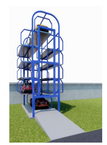
FIGURE 17. Illustration of a vehicle exiting the parking tower

8) The car would stop at the bottom area of the parking tower, and after the rotor stops turning then, the vehicle can be removed from the parking tower (Figure 18)