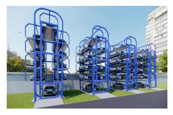
FIGURE 10. Rotary Parking System

Figure 10,11,12,13 is an overview of how a rotary parking system can be used by various vehicles ranging from small to medium-sized cars.