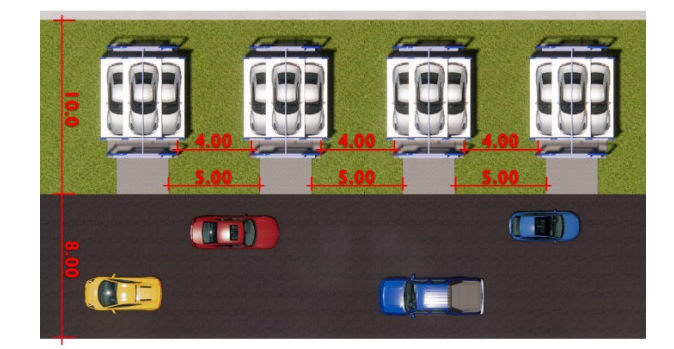
FIGURE 13. Parking tower placement plan

In its operation, this rotary parking system is based on a push button that provides convenience for users to operate it. The mechanism that works is an automatic system that would adjust the slots that residents can use; here is an explanation of the stages in the rotary parking operating system: [10]