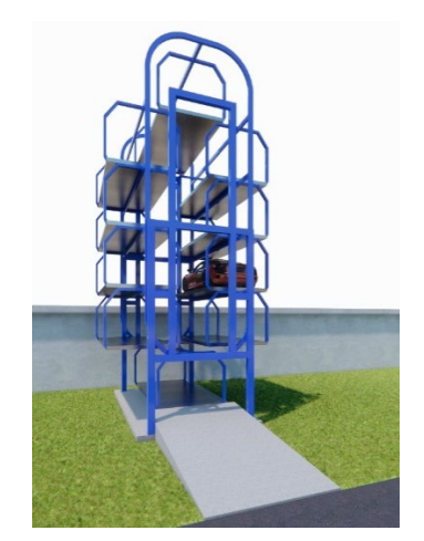
FIGURE 16. Illustration of a vehicle entering the parking tower