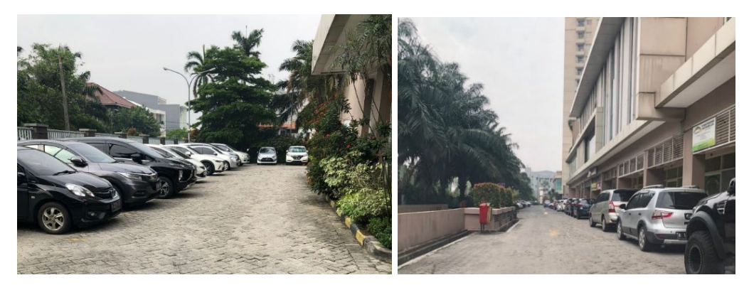
FIGURE 7. The density of lobby parking area

number of parking slots available during the weekdays is higher than the number of parking slots on the weekend.