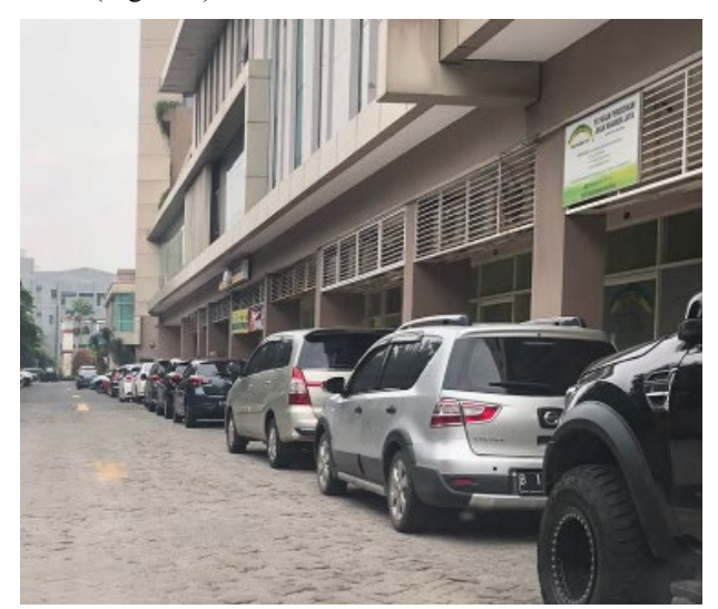
FIGURE 5. Parking conditions of tenant lobby apartment area

The manager provides a spot in the tenant area as a tenant parking area, but visitors now use the area as a public parking area. On weekdays this parking area is not too crowded, but on weekends the area is crowded by visitors from outside the apartment (Figure 5).