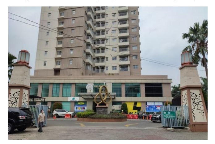
FIGURE 1. Apartment Belmont Residence, Mont Blanc & Athena Tower

Belmont Residence Apartment has 3 types of towers: Athena, Everest, and Mont Blanc. This apartment is located on Jalan Meruya Ilir Raya, RT.8/RW.7, Srengseng, West Jakarta (Figure 1).