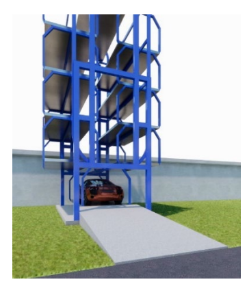
FIGURE 15. Illustration of a vehicle entering the parking tower

3) The rotor on the tower would rotate, and the vehicle enters from the bottom area so that the driver can enter the parking slot (Figure 15).