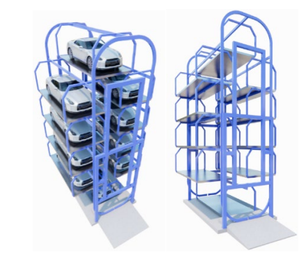
FIGURE 11. Rotary parking system structure