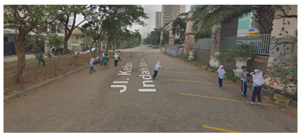
FIGURE 6. Site parking area near residential residents

This parking area was initially used as a parking lot for apartment residents, but access to the area is now closed due to territorial problems experienced between apartment residents and residential residents across apartments. Because there are no barriers or separating signs, this creates a territorial problem that does not have clarity of land territory between apartment residents and residential residents.