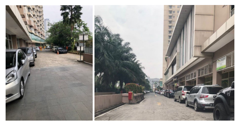
FIGURE 4. Basement parking access

To be able to access the basement parking, residents must pass through the main door and then enter the Mont Blanc tower area (Figure 4), for basement exit access located in the Mont Blanc tower area considering the circulation set to be able to access directly to the exit of the apartment tower. The site's parking area becomes very crowded at certain hours because of visitors or relatives of apartment residents who come to visit. The parking area of the parking lot is provided for tenant tenants in the lobby of the apartment, for the capacity of cars that can be accommodated is per 1 tenant gets 2 parking slots. The tenant's area can be used as public parking if the tenants are unoccupied, but in the current condition of the tenant's area are used mainly by visitors to park the vehicle.