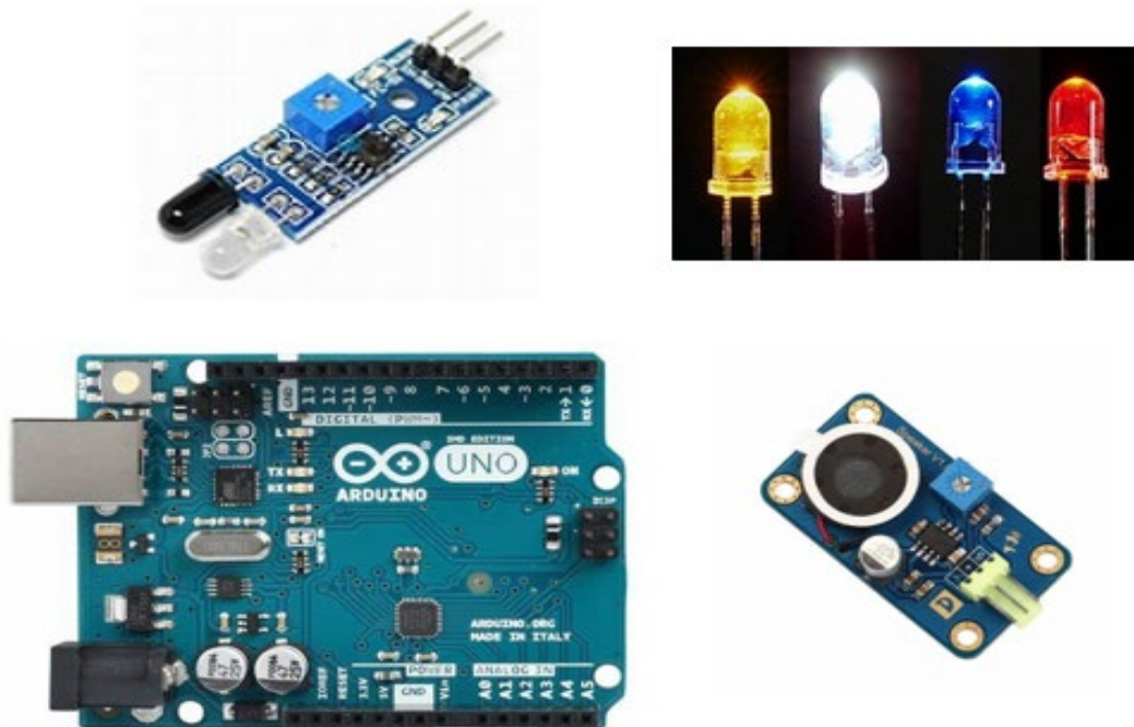
Figure 7. specification components of the music instrument