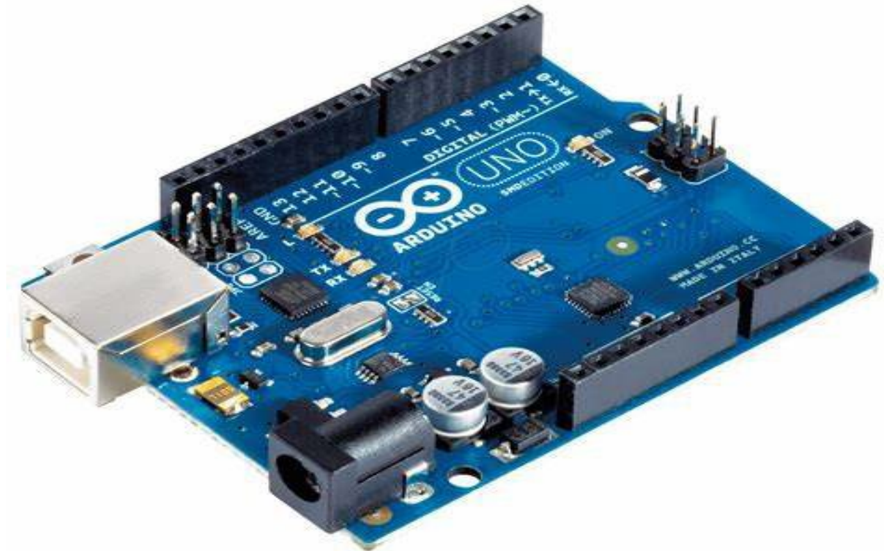
Figure 3. Arduino Uno