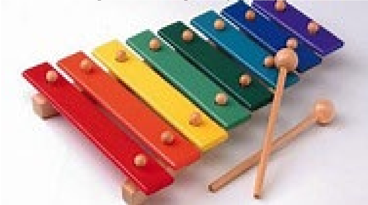
Figure 1. Xylophone

1. Music instrument design: the instrument design can be xylophone or piano