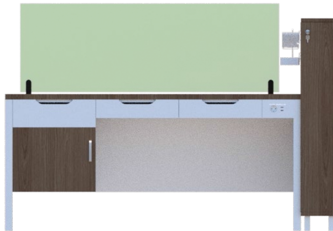
Picture 2. Workstation Front View