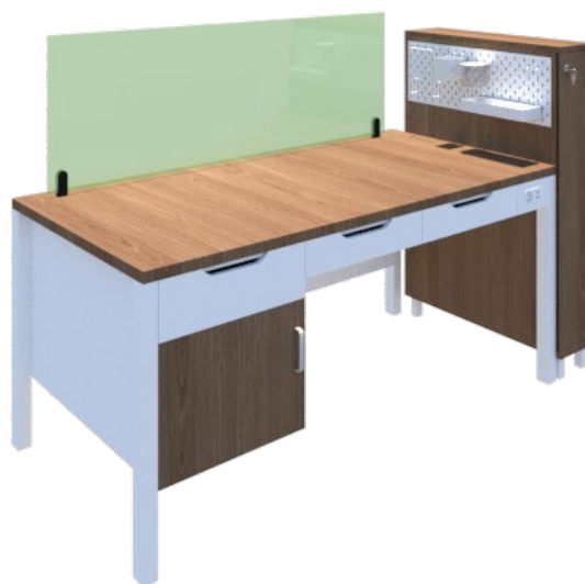
Picture 1. Workstation Perspective

From some of the furniture products above, it can be concluded that furniture made from recycled materials is not impossible to form. This is supported by the success of several brands above in converting recycled materials into ready-to-use furniture and of course having sustainable properties. The implementation of sustainable design on workstations at the Tokopedia office can be shown in the following image.