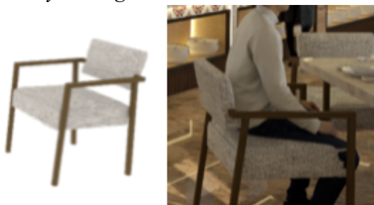
All-Day Dining Seats