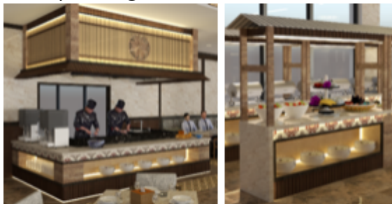
All-Day Dining Fixed Furniture