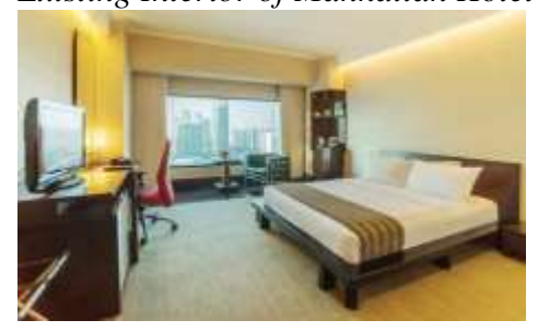
Figure 2 Existing Interior of Manhattan Hotel

Current interior of Manhattan Hotel got negative perspective from visitors as it has explained in introduction above. As a five star hotel, Manhattan Hotel does not meet the criterias and requirements. The material selection need to support hotel image as a five star hotel, also meet the requirements to be easy to clean.