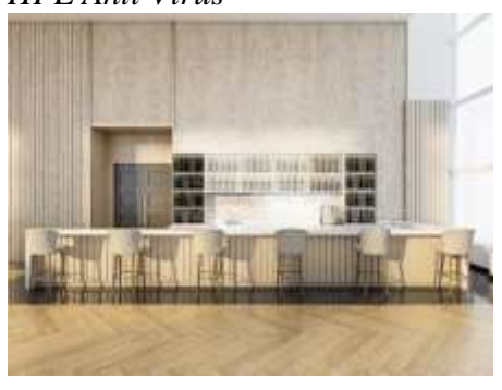
Figure 12 HPL Anti Virus

Another alternative for material is Anti-Virus' HPL as it shown at Figure 12, The wall panel and furniture using antivirus HPL material.