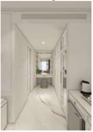
Figure 15 Closed Storage

(f) Bright or light colours finishing would be perceived with cleanliness by users [18].