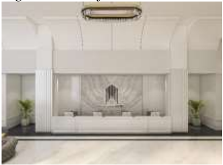
Figure 16 Light Colour of Manhattan Hotel Interior

As shown at Figure 16 above, light color dominates Manhattan Hotel room. It would affect the user's perception so that they feel calmer and safer to stay at the hotel.