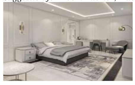
Figure 4 Suggestion for Room Interior, Duco Paint Application on Wall Panels

As it shown at Figure 4, the wall panels are used to support the characters of American Classic. It gives luxury ambience to the hotel room, but still contextual to modern spirit. The wall panels are finished with white duco paint, to keep its elegance with the smooth texture. The texture of wall panels also is easy to clean because it has no pore that might keep the virus.