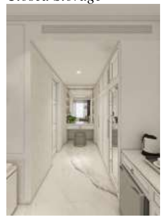
Figure 8 Closed Storage

(f) Bright or light colours finishing would be perceived with cleanliness by users [18]. A research conducted by Magnini and Zehrer found that users tend to feel secure because their perception from degree of lighting, presence of greenery, the materials shininess, schents, white bedding, and the presence of cleaning staff.