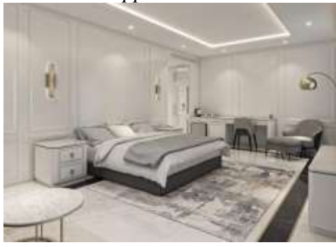
Figure 11 Duco Paint Application on Wall Panels

As it shown at Figure 11, The wall panels are finished with white duco paint, to keep its elegance with the smooth texture. The texture of wall panels also is easy to clean because it has no pore that might keep the virus.