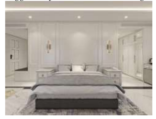
Figure 7 Suggestion for Room Interior Design, Applying Plywood for Wall Panel

(e) Using closed storage shelves so that storage items are not dusty and easy to clean.