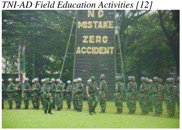
Figure 4 TNI-AD Classroom Educational Activities [13]