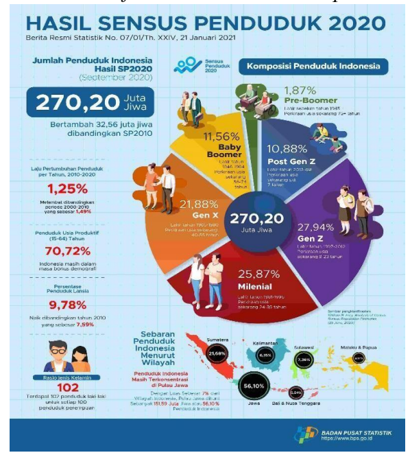
Figure 1 The Results of the 2020 Indonesia Population Census

Source: puslitjakdikbud.kemdikbud.go.id [3]