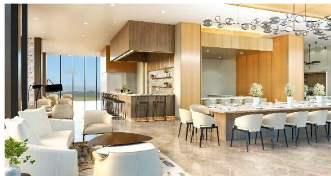
Figure 6 The use colour and lighting in a room

The findings of this study highlight the significance of several factors that must be taken into account when designing a specific theme or style for a space in a structure. This is affected by a number of factors, including the material, color, form, and pattern. The key to making something look ageless is choosing the proper material, as color, shape, and pattern are only supporting components that go along with the right material when it comes to achieving a particular theme or style. In addition, the room's lighting plays a crucial purpose in enhancing the ambiance and producing accurate design visualization.