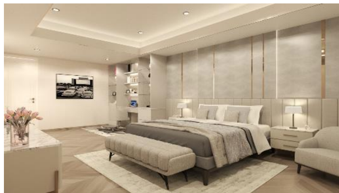
Figure 2 The employment of line elements in the room and the utilization of the room's proportions

The use of specific furniture or things to build a line concept in the area that will offer a particular impression is a key component in producing a maximal interior design. To create a timeless appearance in the application of timeless design, the usage of line elements can be made utilizing furniture or wall molding.