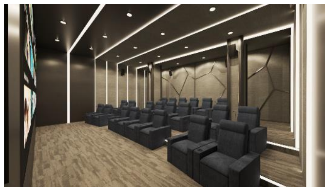
Figure 3 The use of textures and lighting in a room

The use of a finishing texture or specific material will provide a room a sharper effect on the design that is brought. Texture is a vital component in a room. Finishing textures in classic designs can be used on furniture, walls, or other materials to leave an enduring impression.