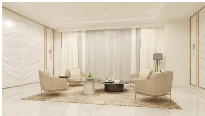
Figure 5 The use of furniture and color in a room