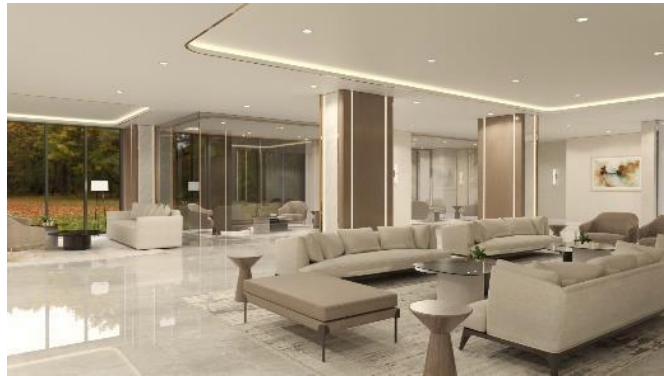
Figure 4 The use of shape and pattern in a room