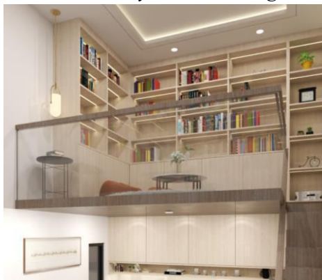
Children's Study Room Ceiling