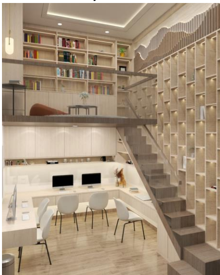
Children's Study Room View 1