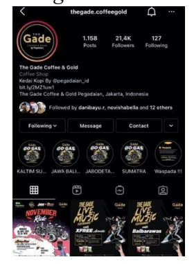
Figure 3 Instagram The Gade Coffee and Gold (@thegadecoffee.gold)

The Gade Coffee and Gold chooses Instagram as a marketing medium because Instagram is a media sharing service with the main focus on sharing photo or video content that has an effective increase on its users. This was stated by Angga Mulya, that "In accordance with marketing efforts, well, we use IG because until now Instagram is a social media has a fixed and stable number of active users, even tends to increase".