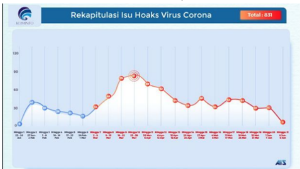
Figure 1 Hoax in Covid-19 Pandemic, 2020

On Facebook there are 804 distributions, on Instagram 10 distributions, on Twitter there are 340 distributions and YouTube there are 6 distributions related to the Corona hoax issue, he explained when giving information to IDN Times via Instagram live broadcast, Tuesday 2020 [1].