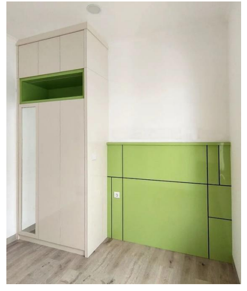
Figure 33D rendering of Faraday Housing children's room interior perspective 1

Fresh light green colour gives a refreshing and energizing effect on the interior of the children's room Faraday Housing