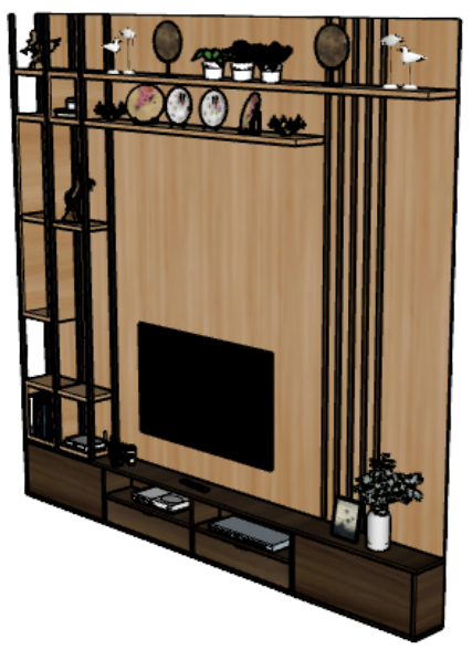
Figure 6 "Choose" design stage, selected tip-on-swing and cut-out handle models.