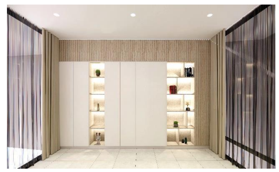
Figure 4 Perspective of SOHO Design for Alaia Project.

In addition to the work desk area, SOHO is equipped with a large storage cabinet on the opposite side of the work desk. The storage cabinet is designed using white that gives an impression of the clean and spacious room. The wall on the storage cabinet is made with the same material as the work desk. Then, the ceiling design is used a white color that makes the room looks brighter.