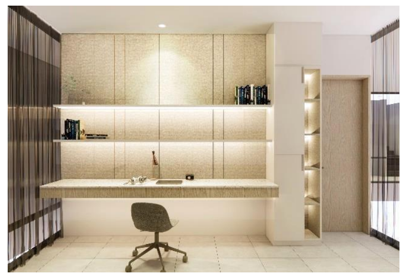
Figure 3 Perspective of SOHO Design for Alaia Project.

The interior design of SOHO for Alaia project was made with modern minimalist theme as the client's desired. The design is made quite simple, but still looks cozy and elegant at the same time. This workspace dominated with the color of white and brown to give a warm ambience for the user.