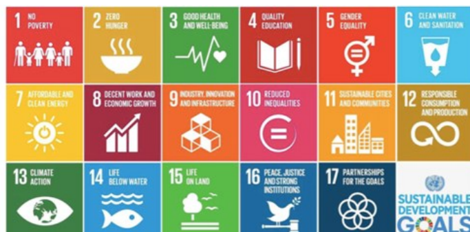
Figure 1. The SDGs